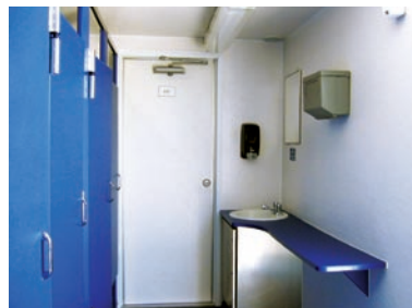
Sporting Diamond's signature rich blue, the attractive comfort stations sparkle with a refreshing cleanliness.

If you're planning a company party, wedding or other event, please call us at (888) 744-7191 and ask to speak to your area's Special Events Coordinator.