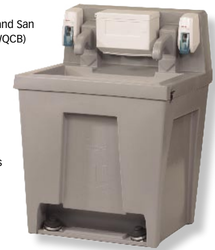
Diamond's CAL/OSHA-approved two-station sink services up to 40 workers.